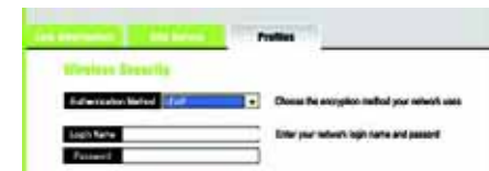
Figure 6-29: LEAP Authentication

Click Next to continue or Back to return to the previous screen.